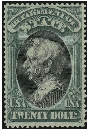
$20.00 State Department, Scott number O71

On July 5, 1884, the Official stamps became obsolete with the universal adoption of the Official Penalty envelope.