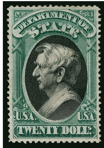
Dollar-value State Department Issues