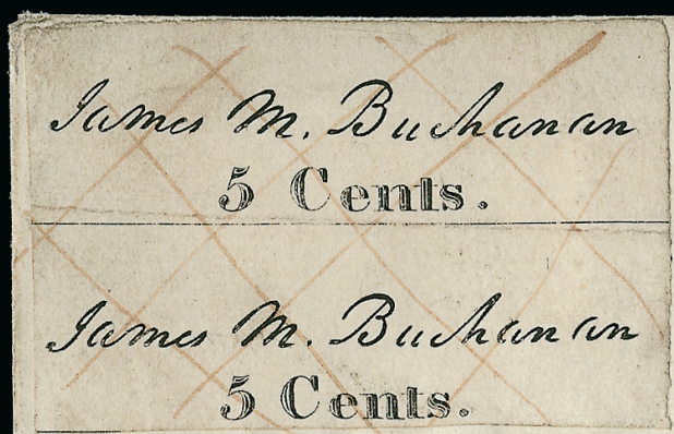
Lot 4 Detail of Stamps