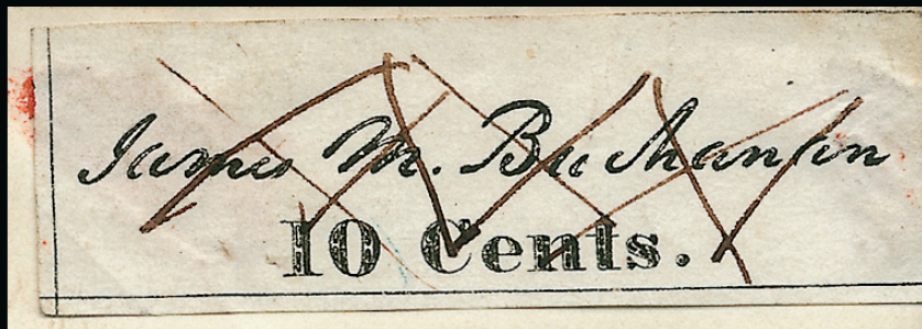
Lot 3 Detail of Stamp