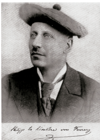
Philippe la Rénotière von Ferrary (1850-1917)