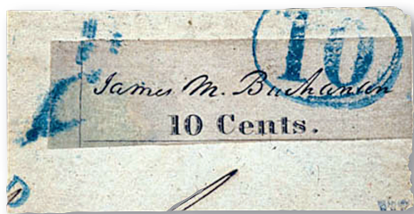
This repaired example of the 10c on Bluish paper is the first Baltimore 10c adhesive discovered

The earliest discoveries of the Baltimore 10c provisional adhesive stamp were made in 1895 and 1896-97. Based on reports published by various writers, it appears that the damaged 10c on Bluish paper, which is tied on piece and repaired (3X4-PCE-02),