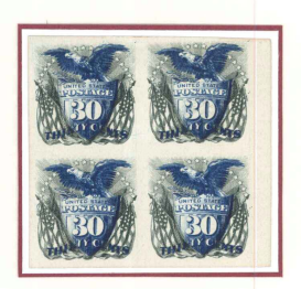
Extract from the only complete set of Atlanta colour trials in blocks of four still extant Ex Earl of Crawford

This attractive and colourful array of proofs were prepared for a display at the International Cotton Exhibition held in Atlanta, Georgia from 5 October to 31 December 1881. This fair was held alongside the Western and Atlantic Railroad tracks a short ride from downtown and was attended by an estimated 250,000 people