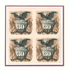
1881 Atlanta Colour Trials

Post-production issues are also strongly represented in Dr. Woo's collection. The 1869 Pictorial stamps were re-issued in 1875, and there were also proofs made in the late 19th and early 20th century. All of the re-issues and proofs are represented, including a set of blocks of four of the Atlanta Trial Color proofs prepared for the 1881 International Cotton Exposition, which is believed to be unique.