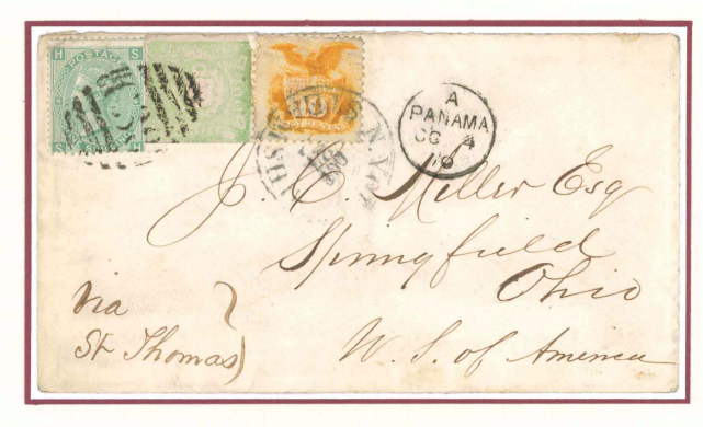
Used from Peru

10c Eagle & Shield - Combination usages on Cover Overseas Origination