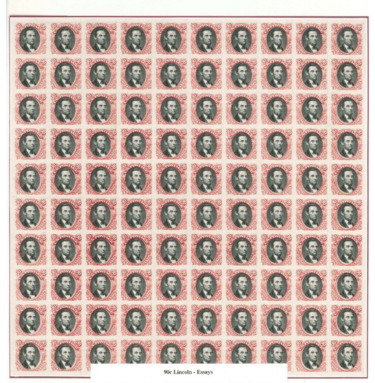
The only recorded complete sheet of plate proofs on India paper Ex Earl of Crawford & Kapiloff