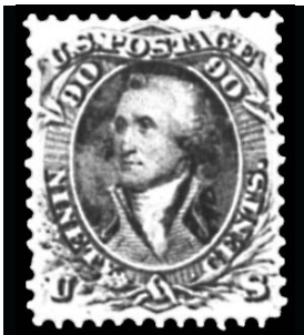
62-UNC-11 RAS 3/23/1972 "microscopic split in one perf" (considered sound in census)

SPECIAL NOTE: There are many United States stamps that look similar to the rarities listed below. Some of the differences between expensive rarities and common stamps can be subtle, including differences in perforation, shade and size. These stamps should have certificates from a recognized expertizing committee, such as The Philatelic Foundation or P.S.E. If you think you have one of these rarities, we cannot help you until after it has such a certificate.