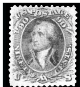
62-UNC-20 Green Coll. - HR 5/26/1943 (set signed Luff) PFC 15606 "Not 62, but 62a privately perforated" (this is likely incorrect)