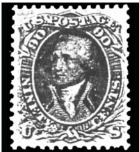
62-OG-15 Caspary Coll. - HRH 11/19/1956 PFC 37165 "Genuine, small tear and corner margin crease"