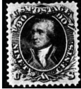
62-UNC-22 Regency/Superior auction, 8/5/2005, lot 1115 - $13,500 PFC 429342 "Genuine, small thin spots, two tiny tears, and reperforated at right" APS 113383 "Genuine, creased, thinned, sealed tears, nibbed corner perf