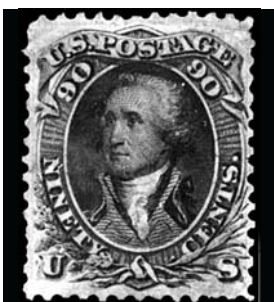
62-UNC-17 PFC 223969 "Genuine, extensively repaired with portions of design added, including identifying characteristics"