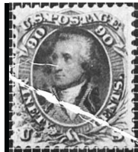
62-UNC-14 PFC 2105 "Genuine, cleaned" (Photo damaged, not the stamp)