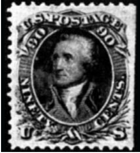
62-UNC-21 Green Coll. - Barr 4/17/1945 "s.e. at R., slight closed tear at B."

SPECIAL NOTE: There are many United States stamps that look similar to the rarities listed below. Some of the differences between expensive rarities and common stamps can be subtle, including differences in perforation, shade and size. These stamps should have certificates from a recognized expertizing committee, such as The Philatelic Foundation or P.S.E. If you think you have one of these rarities, we cannot help you until after it has such a certificate.