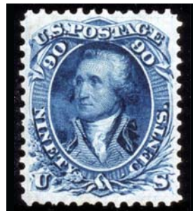
62-UNC-16 Caspary Coll. - HRH 11/19/1956 Concord Coll. - RAS 5/19/1994, Lot 85 - $24,000 Floyd Coll. - SPG 10/23/2001, Lot 125 - $55,000 PFC 116325 "Genuine"