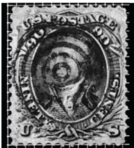
62-CAN-13 PFC 2040 "Genuine, trial cancel, defects"