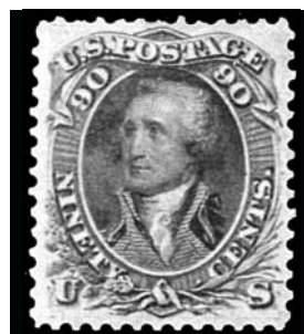
62-OG-18 275261 "Genuine, PH, light diagonal crease at T.L., small hole in L.R. "90"