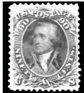
62-UNC-12 RAS 4/29/1981 Weissman Coll. - SPG 5/8/1998, Lot 1040 - $16,000 PFC 257255 "Genuine, no gum"