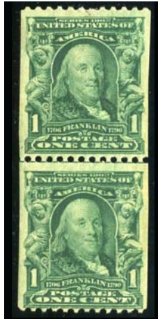
316-OG-LP-10 Newport Coll., PRW 5/2008 PFC 14513 "Genuine" PFC 48933 "Genuine" PFC 460784 "Genuine, previously hinged, top stamp with tiny surface scuff in the margin at top center"