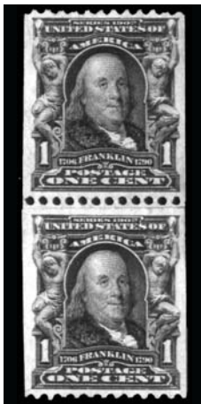
316-OG-PR-12 PFC 53722 "Genuine paste-up pair" PFC 224560 "Genuine paste-up pair"