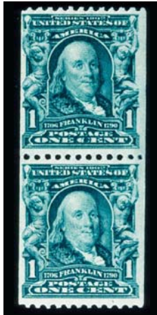
316-OG-PR-09 RAS 1985 Rarities, Lot 269 "minor h.r. and hinge reinforcement" - $27,000 PFC 14193 "Genuine coil pair" PFC 148882 "Genuine, tiny thin spot at B."