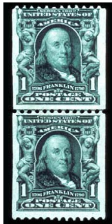
316-OG-LP-11 RAS 1977 Rarities - $7,000 RAS 1981 Rarities - $12,000 Hewitt Coll. - Ivy 5/26/1986 RAS 1987 Rarities - $16,500 RAS 1995 Rarities - $54,000 Brody Coll. - SPG 12/6/2002, Lot 89 - $65,000 PFC 100616 "Genuine stamps rejoined and tiny corner crease at B.R."