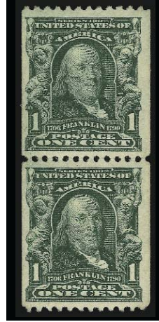
316-OG-PR-08 Hoffman Coll., RAS S956, 5/8/2008, lot 300 - $230,000 PFC 12616 "Genuine coil pair" PFC 407193 "Genuine PH"